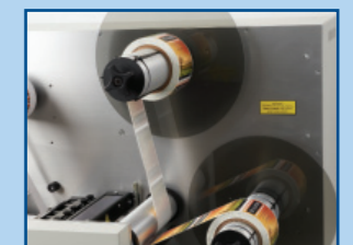
Rewinding to multiple finished rolls