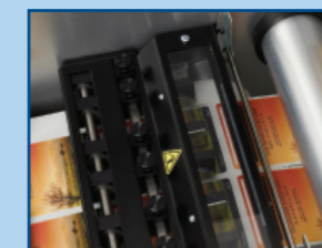
7 blade slitter station