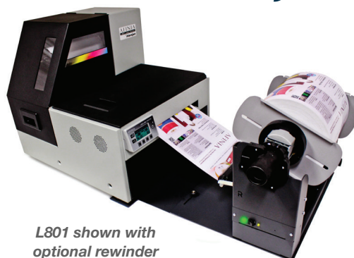
L801 shown with optional rewriter