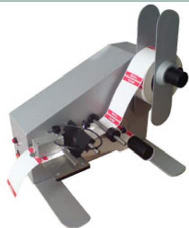
ALpeel with micro switch sensor for transparent and circular labels